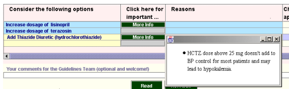
Figure 2. Thiazide dose advisory.

(1) In accordance with JNC 6 and VA hypertension guidelines, ATHENA DSS recommends use of thiazide diuretics as first line drugs for many patients and as part of a multi-drug regimen for most patients. Thiazide diuretics were among the first drugs available for treatment of hypertension, and were used in many of the early studies showing the benefit of lowering blood pressure. Early studies with these drugs used doses that are now recognized as unnecessarily high for most patients. Many more recently graduated clinicians have been taught extensively about newer drugs such as L-type calcium channel antagonists and are less familiar with dosing of thiazide diuretics; many clinicians who graduated 15-30 years ago became familiar with these drugs when much higher doses were in vogue. We noted in reviewing drug use at our institution that some clinicians were prescribing thiazides at inappropriately high doses that are associated with development of hypokalemia. We realized that by encouraging use of this drug class, we could inadvertently contribute to an increased rate of hypokalemia if we did not simultaneously provide cautions about dose. Accordingly, when ATHENA DSS recommends use of a thiazide diuretic, an advisory is provided about dose (Figure 2).